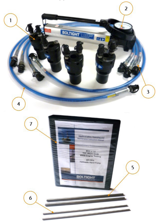
Tool Set Contents