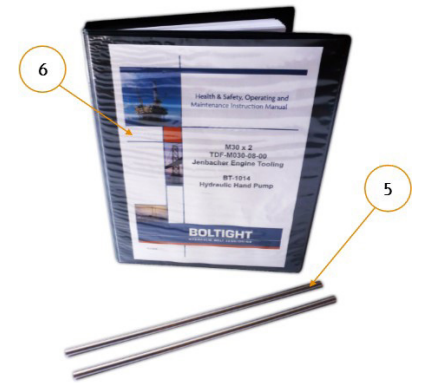
Tool Set Contents